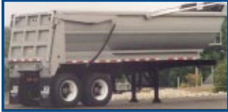
Half round steel trailer is ideal for hauling rock and other heavy materials

PRSRT STD U.S. POSTAGE PAID GREENSBURG, PA PERMIT NO. 88