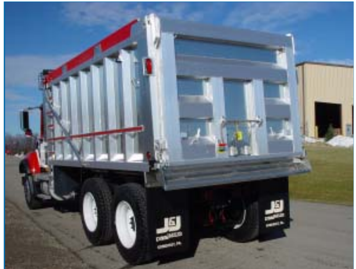
DYNA HAULER/MH-QT Aluminum Material Hauler

In today's increasingly competitive marketplace, we realize that owner/operators need quick response times when ordering dump bodies for their trucks. Truck dealers, too, want faster turnaround options for their truck chassis customers. To answer this need, J&J Truck Bodies & Trailers is introducing a new Quick Turn Program for our most popular dump bodies. Whether you choose aluminum or steel, these extremely popular models can be used for many hauling applications.