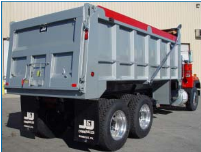
DYNA HAULER/LWC-QT Light Weight Steel Crossmemberless

Give us your truck and in just 15 working days, we'll return it to you with our most popular aluminum or steel dump body!